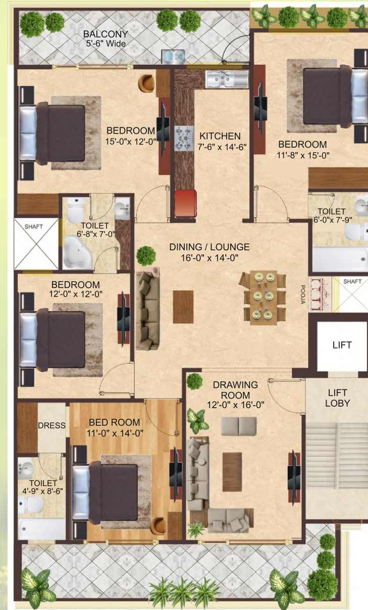
FLOOR PLAN LAYOUT | 4BHK (Type - B) 10.76mtr X 21.19mtr