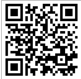
Google Map Direction