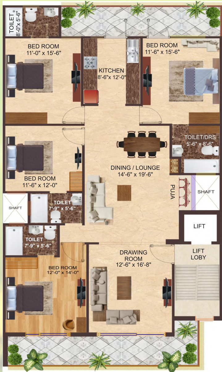
FLOOR PLAN LAYOUT | 4BHK (Type - A) 10mtr X 25mtr